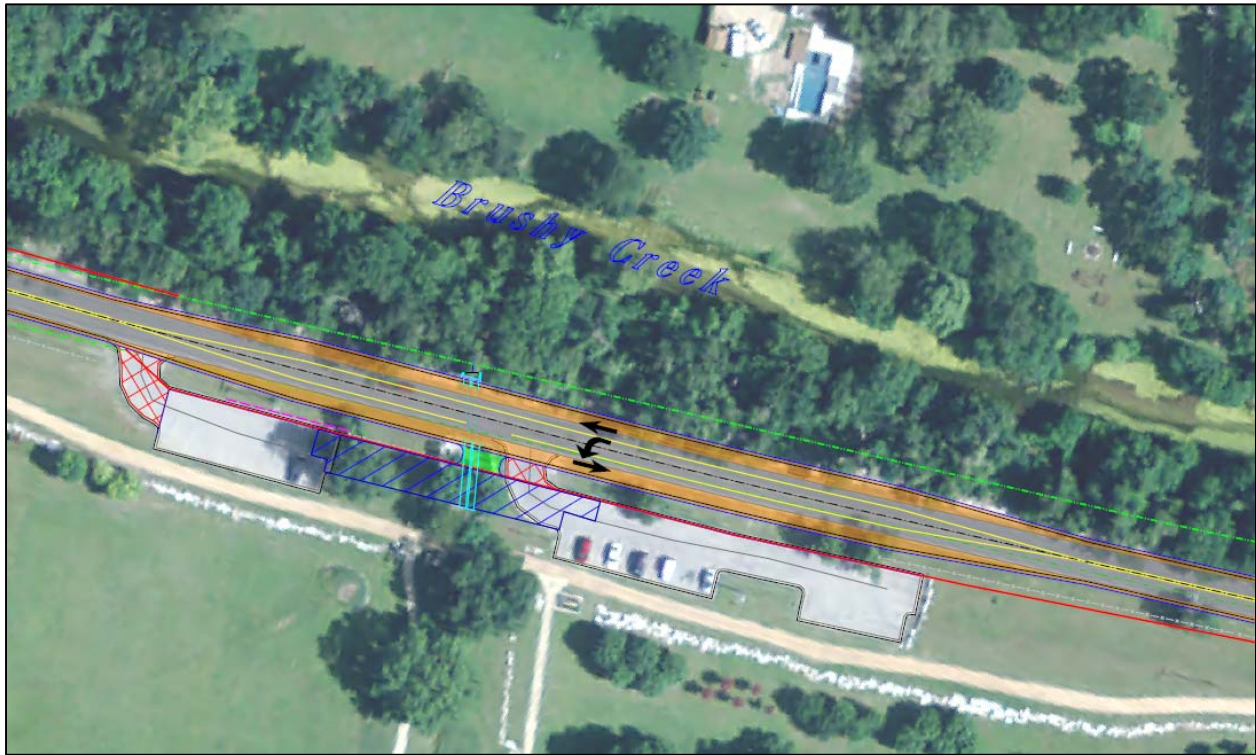
Proposed left-turn lanes into park facilities and widened shoulders along Hairy Man Rd.